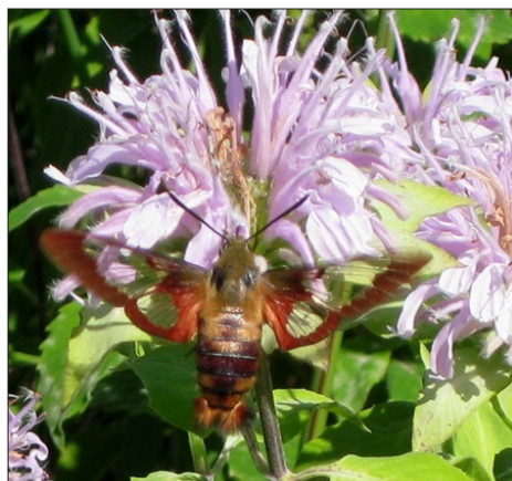
Hummingbird moth on wild bergamot