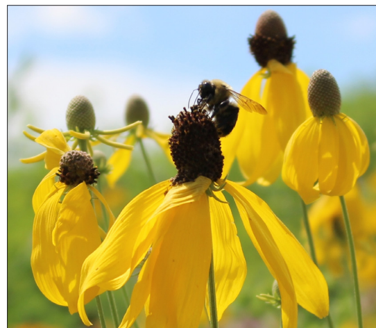
Bee on yellow coneflower

Planting a diverse mix of flowering plants that provides a sequence of blooms from early spring to late fall will have the most impact.