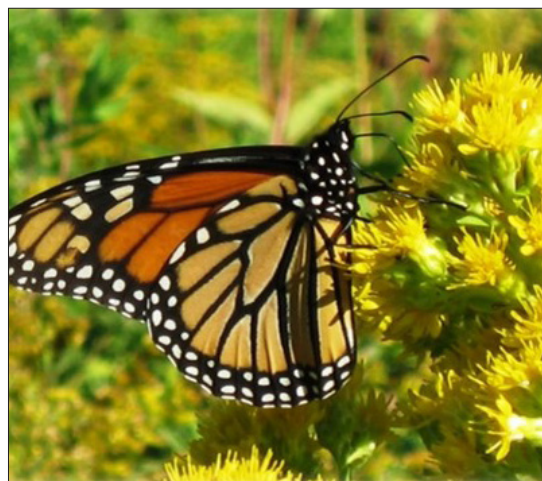
Monarch butterfly on goldenrod

Planting a diverse mix of flowering plants that provides a sequence of blooms from early spring to late fall will have the most impact.